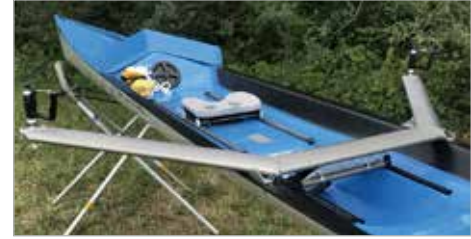
Heavy duty ali wing on 1x