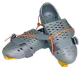
Active Tools adjustable shoes 2 sizes available: 40-45 and 43-48