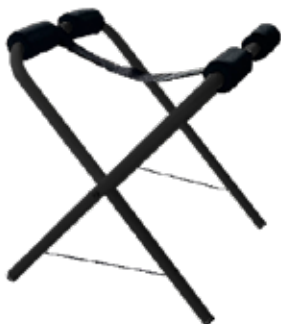
Steel trestles (simple for CO1x)