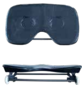
Single action type with bearings, height adjustable.

Elite carbon and Elite Plus boats are supplied with lightweight carbon seat tops.