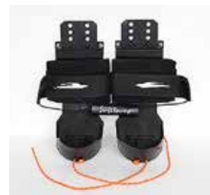
Heel restraints and solid heels for safety, rounded heels for a good fit. Approved by USRowing and British Rowing.