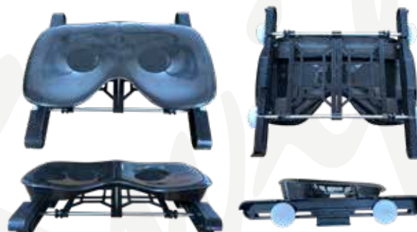
Double action type (add extra 220g per seat)