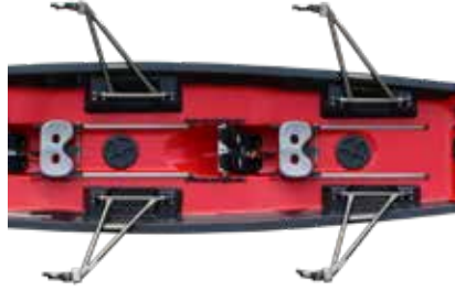
Folding ali back on 2x and 4x+