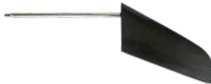
Standard (250 mm)