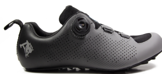
Against Rowing Shoes