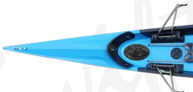
CO4x+ sliding type wave break & choice of hatch