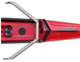
Reverse ali wing on 1x (Black Swift for Elite Carbon grade)